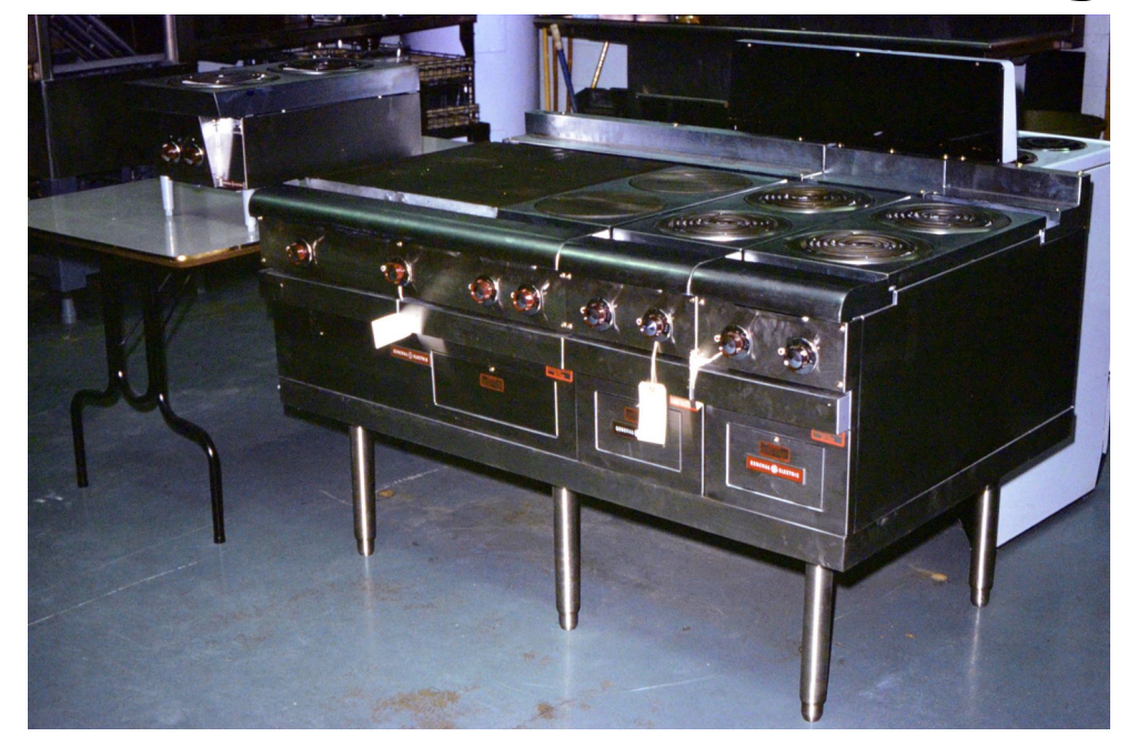
Our faithful stove, brand new in 1974!